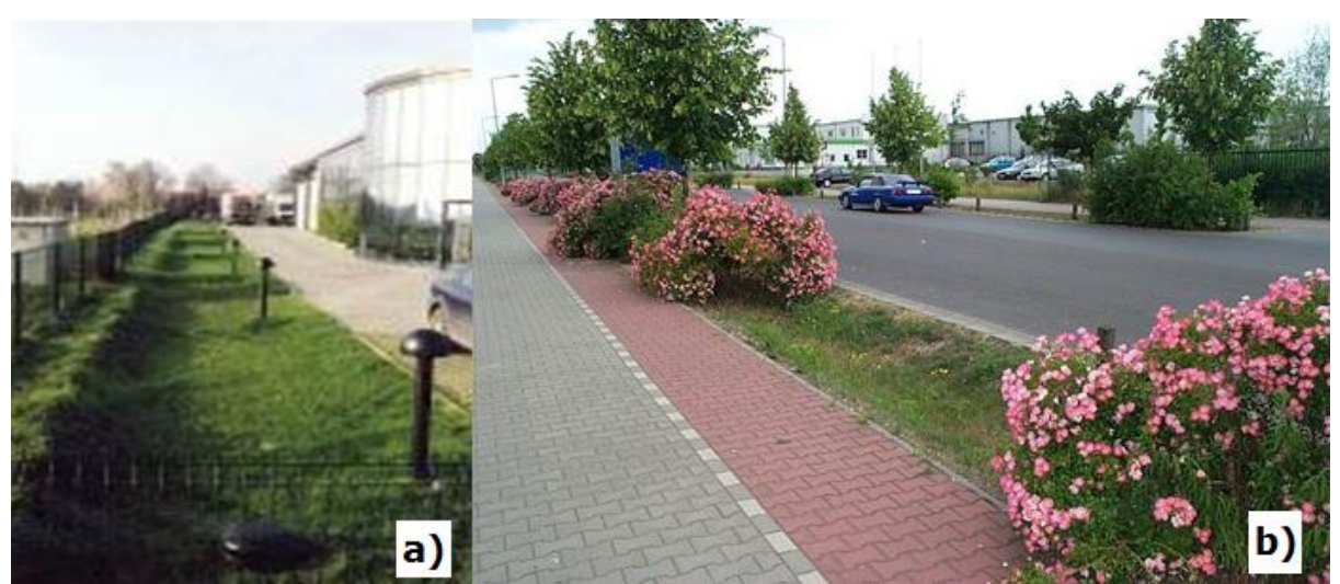
Figure 2: Hoppegarten, retention measures on private properties (a) and public roads (b)