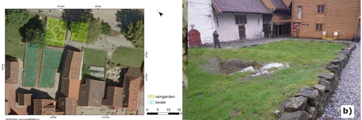
Figure 3: a) Site plan of Bryggen; b) Swales on Unesco world heritage site.

Since the primary target of the swale system at Bryggen is to increase groundwater infiltration for preservation of organic archaeological assets, particular focus was placed on removal efficiency of oxidizing agents such as oxygen and sulphate, as those may induce increased decomposition of organic material. A baseline study was performed to characterize the stormwater quality from the upstream roofs and road areas. Results showed a large variation in the amount of pollutants bound and unbound to suspended solids compared to previous study results. Lead in particular, showed a low average percentage of bound pollutants and could be the result of mobilization by road salt. Pollutants also appeared to be more dissolved than previous research results. This may inhibit single-step treatment performance. Therefore, a "treatment train" of several SUDS devices was developed in order to achieve high pollution removal rates and prevents loss of valuable archaeological assets and consequential subsidence. The initial hydraulic monitoring results showed that the condition of the cultural deposits was improved (wet conditions with lack of oxygen) by infiltration of stormwater.